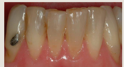
Examples of silver fillings