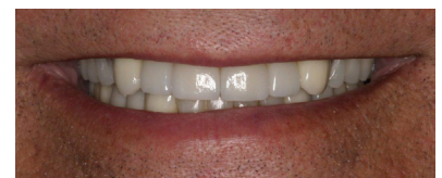
Restores smile and function